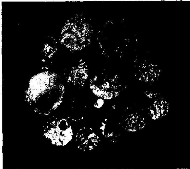
FIG. 1. Saptadanta nasika : shells showing the dorsal view in some and the ventral view in others. Depressions on some of the shells indicate reinfestation by younger individuals of the same species. x 14.